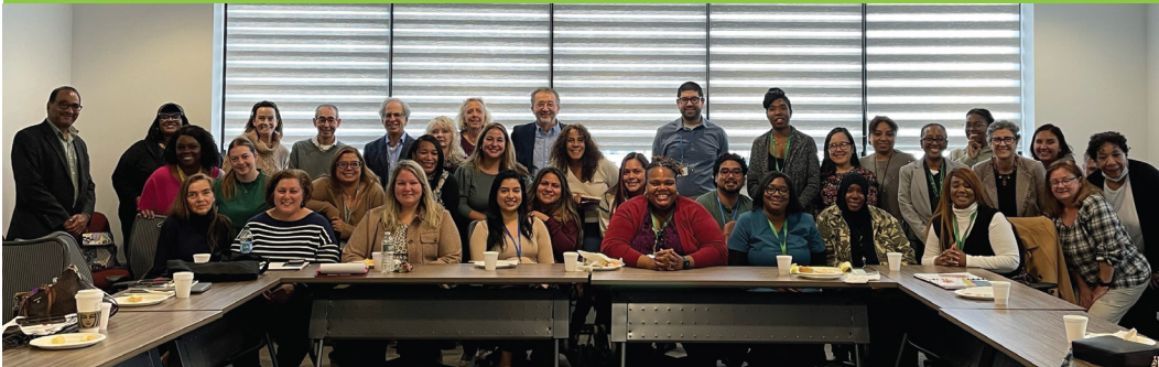
On November 1st, the Bridgeway team hosted a Meet and Greet with the team from Neighborhood Health